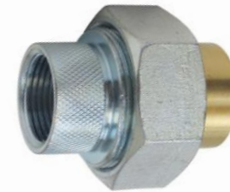
FIP Galv x FIP Brass